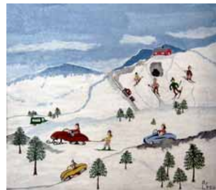
Lawrence Fogg, Snowmobiling and Skiing, Acrylic on slate